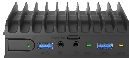
K4Edge Fit – Front View