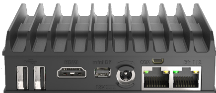
K4Edge Fit – Back View

Quickly add K4Edge as a Service (KaaS) to any network installation