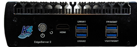
K4Edge Server - Front View